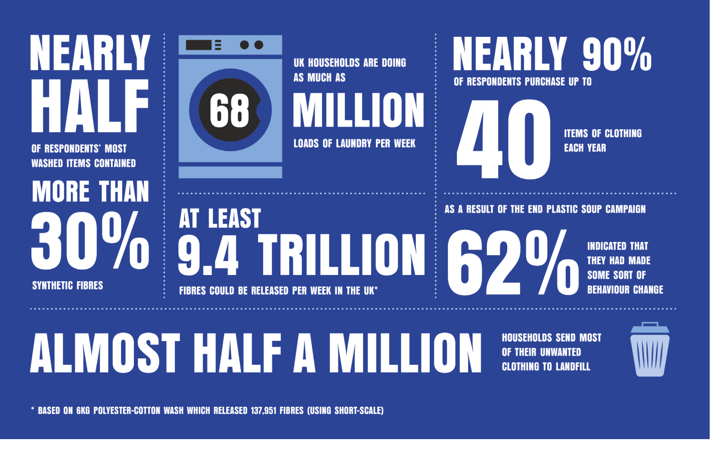
Figure 2 - Findings from the WI's 'In A Spin' report

With the growth of the UK retail market for fast fashion, the average consumer buying 60% more clothing than they did 15 years ago, and the release of at least 9.4 trillion microplastic fibres per week from laundry in the UK<sup>(40)</sup>, there is an urgent need for Government and garment producers to work together to identify and implement strategies to mitigate microfibre plastic release as much as is feasible.