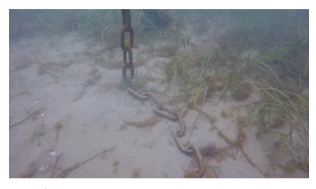
Damage from traditional mooring chains.