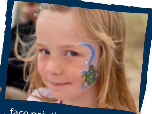
...face painting in return for donations?