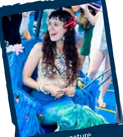
...a marine creature costume competition?

Let your imagination go crazy. You can do anything for your Big Blue Day, but whatever you do, do it in blue! Here are some popular ideas to add to your event: