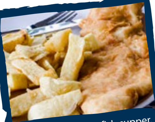
...host a sustainable fish supper. See www.fishonline.org for the latest seafood advice.