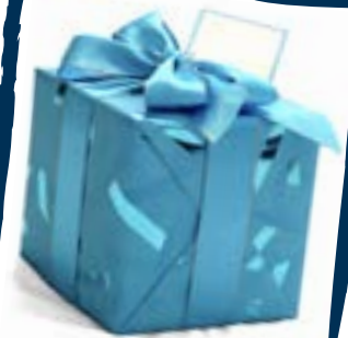
...a blue raffle?