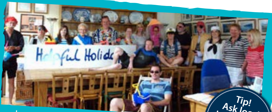
...decorate your desk, office or classroom in blue?

Tip! Ask local businesses to donate prizes.