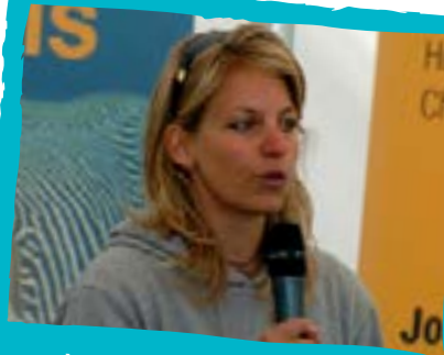
...hold an ocean quiz?