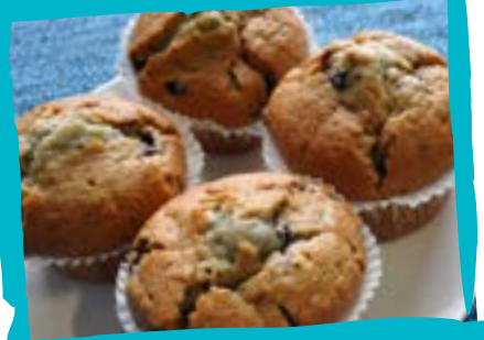
...bake some blueberry muffins to sell?